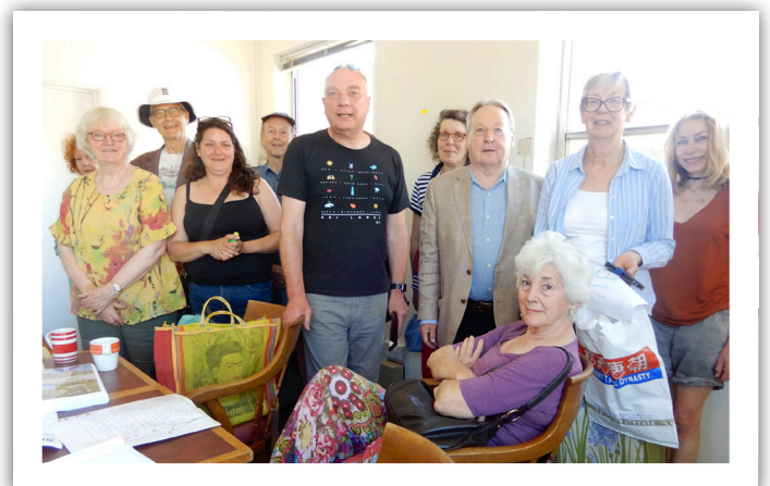
Team of volunteers off to deliver the household survey questionnaires

In parallel, we have been working towards drawing up the Saxmundham Neighbourhood Plan (NP). By law, an NP must not contradict the policies of the Local Plan, but