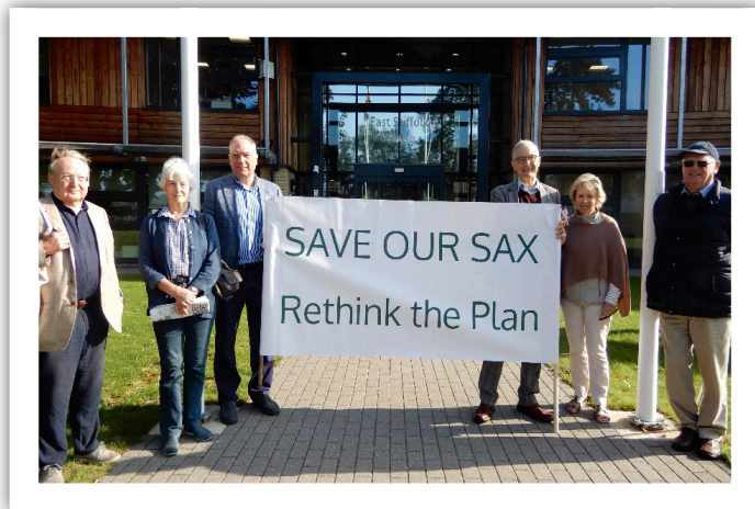
Making our point at the start of the Local Plan public inquiry