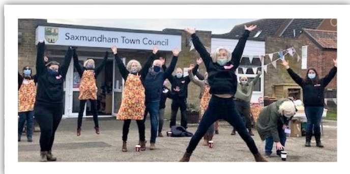
Community Fridge volunteers at the Town House

The council offices opposite the station – now renamed the Town House - have been refurbished with the installation of new windows and internal decoration. The