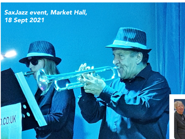
SaxJazz event, Market Hall, 18 Sept 2021