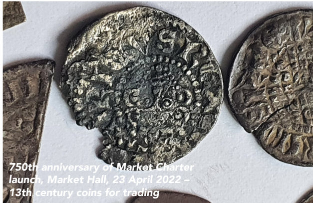
750th anniversary of Market Charter launch, Market Hall, 23 April 2022 – 13th century coins for trading