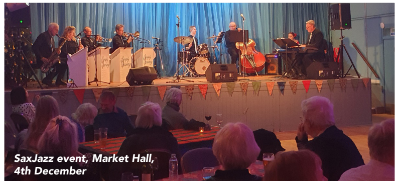
SaxJazz event, Market Hall, 4th December