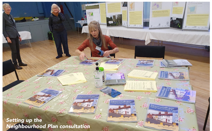
Setting up the Neighbourhood Plan consultation