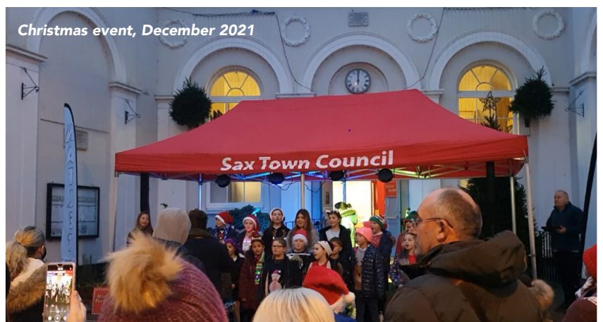
Christmas event, December 2021